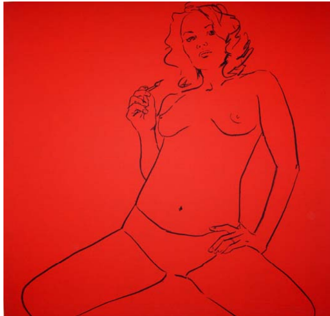
Portrait of the Artist as an Artist (Part 1) acrylic on board 90 x 90 cm (2007)