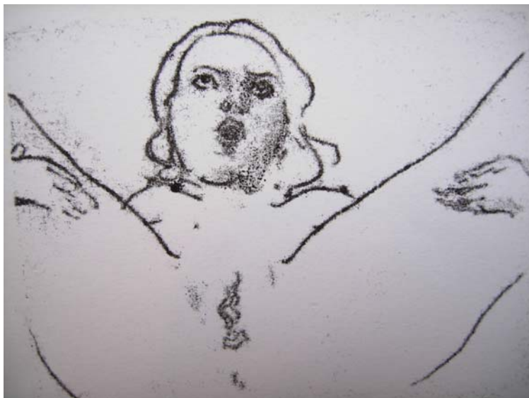
Legs Spread 'O' monoprint 21 x 30 cm (2007)