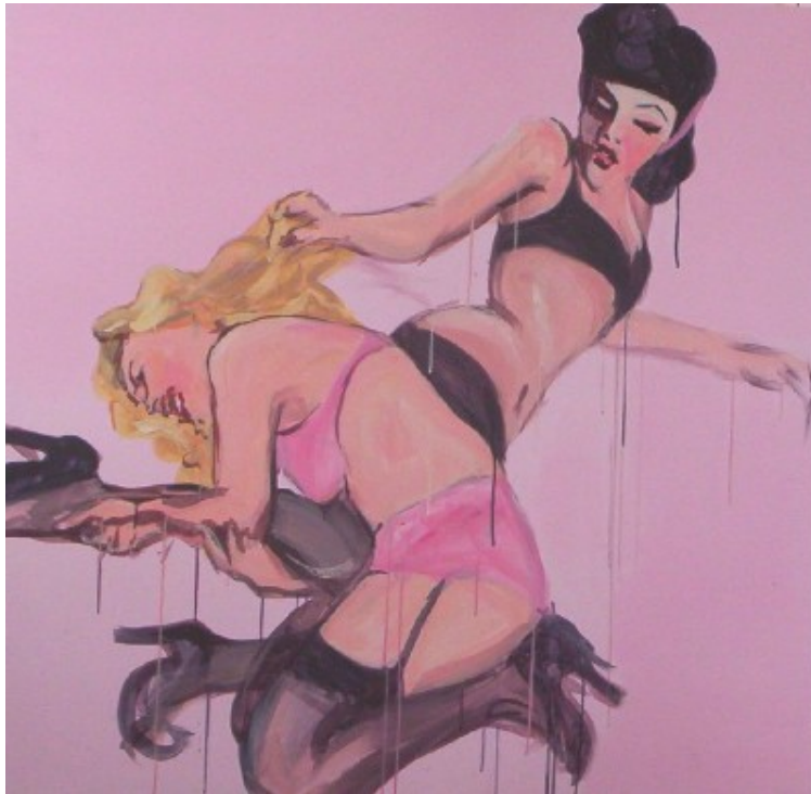
I Could Gobble You All Up (pt 1) acrylic on board 100 x 100 cm (2004)