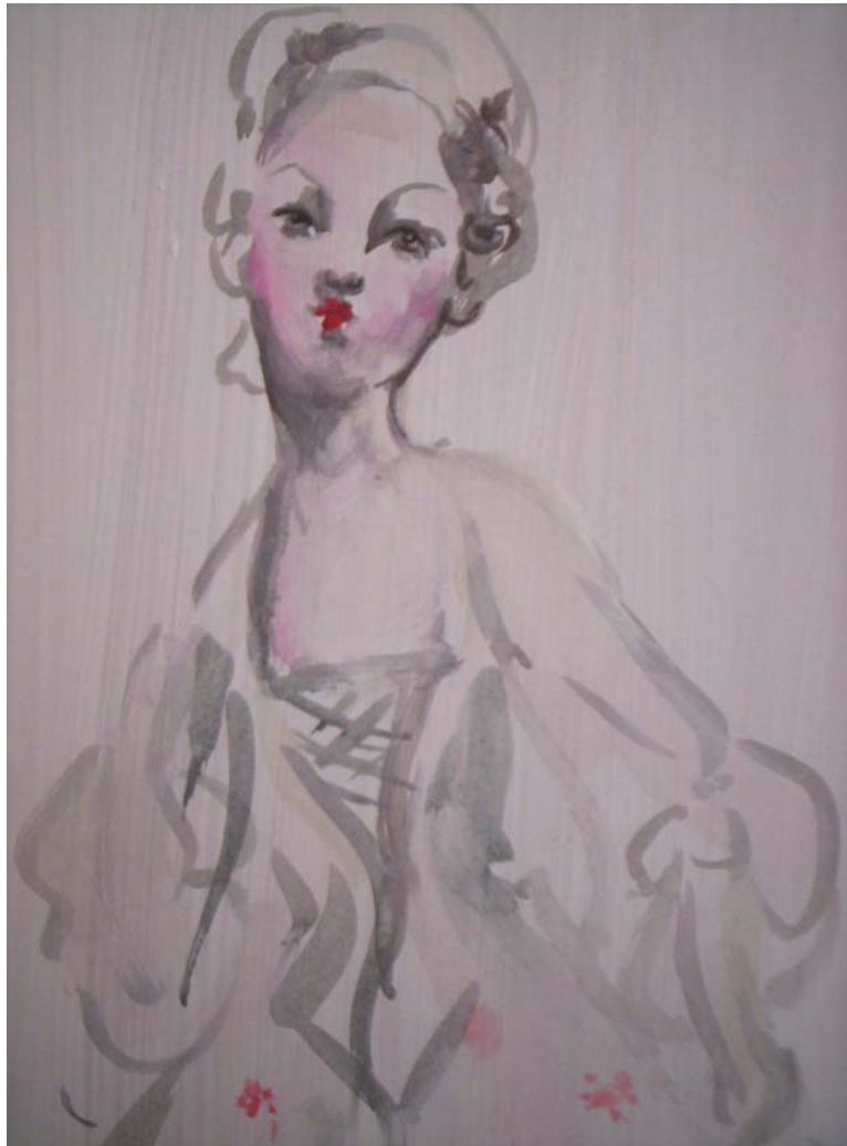
Red Petal Dress acrylic on board 60 x 60 cm (2006)